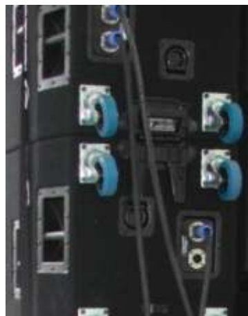
RS 5 stacked showing castor positions, standard twin NL8 input plates, safety tie points, hinge plates and a hinge assembly normally used when flying.